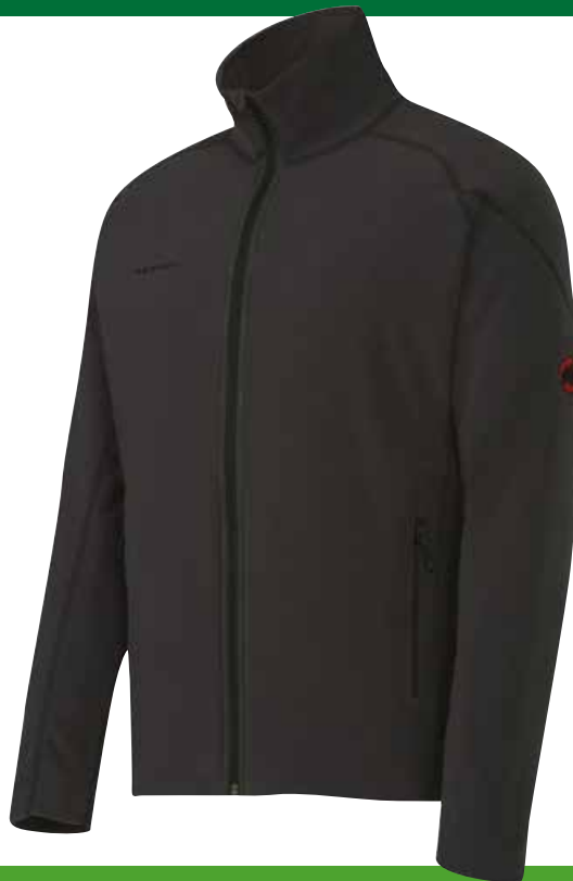
Microfleece 1/2 zip